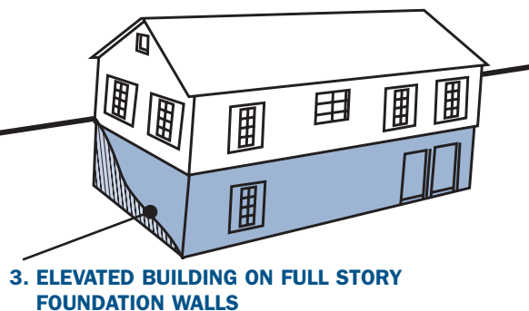
3. ELEVATED BUILDING ON FULL STORY FOUNDATION WALLS

When a building is elevated on foundation walls, coverage limitations apply to the “crawlspace” below.