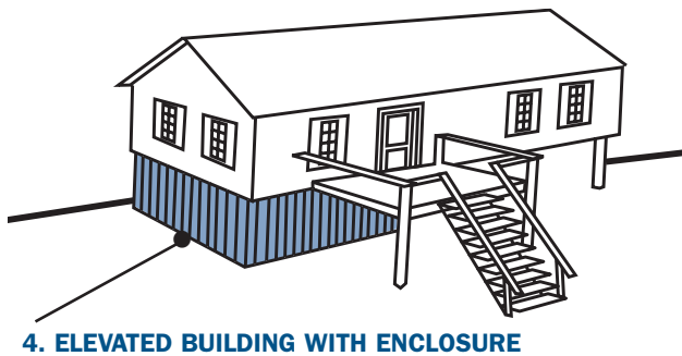
4. ELEVATED BUILDING WITH ENCLOSURE

Coverage limitations apply to the enclosed areas (lower floor) even when a building is constructed with what is sometimes called a “walkout basement.”